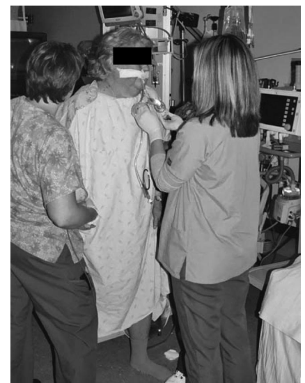
Figure 2. An orally-intubated level IV patient, exercising while standing.

Outcomes. The primary outcome was the proportion of patients surviving to hospital discharge who received ICU physical therapy. Secondary outcomes included days until first